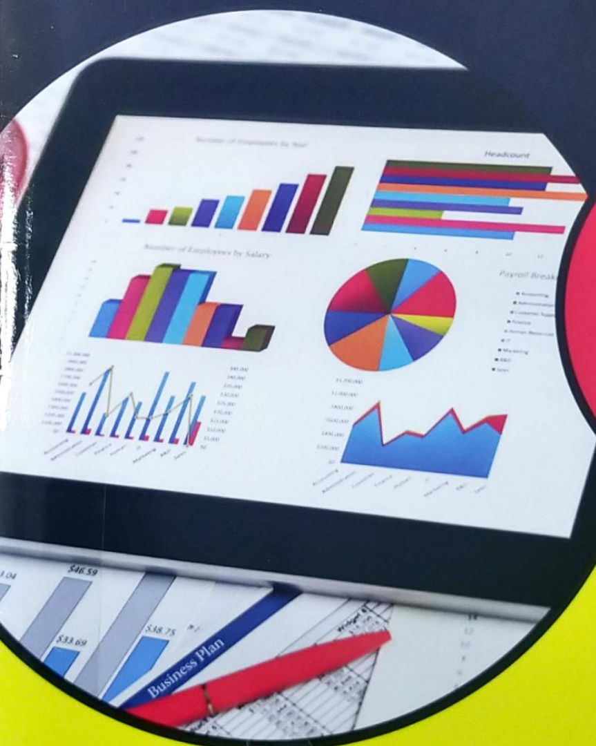
Chart your course to business success

Create a solid business plan to guide you